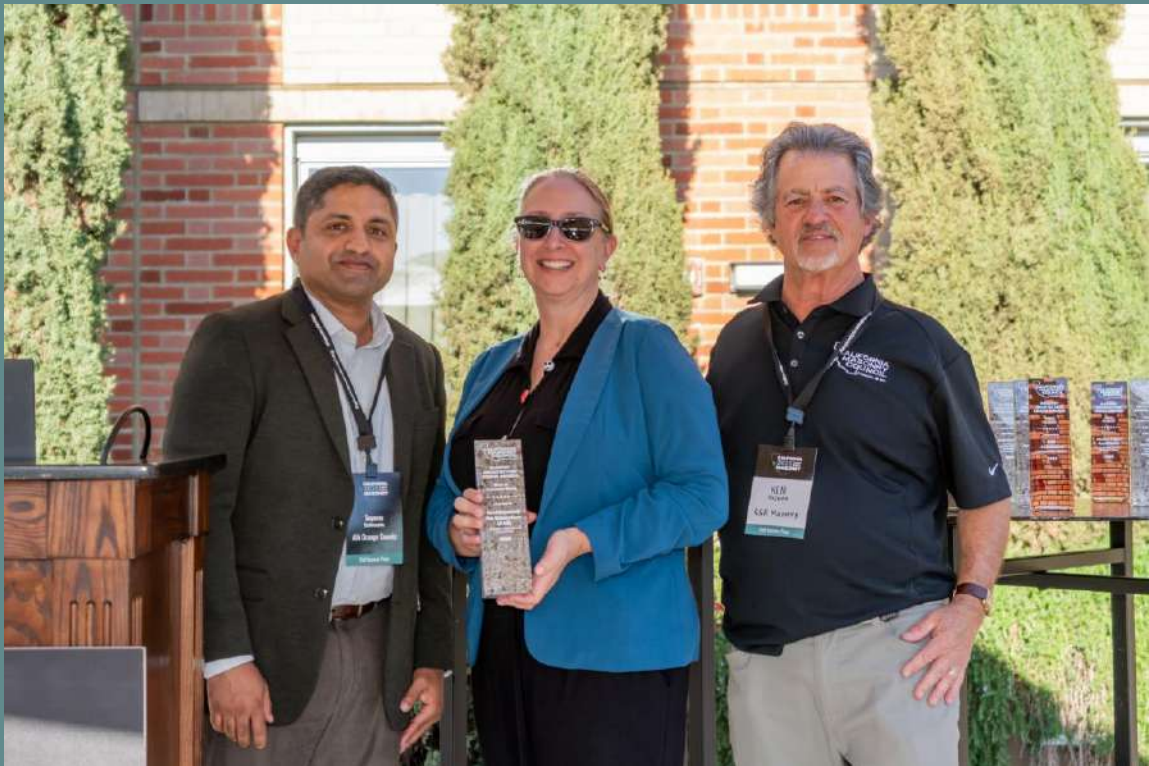
May 9 th , 2025. Luskin Conference Center & Hotel @ UCLA