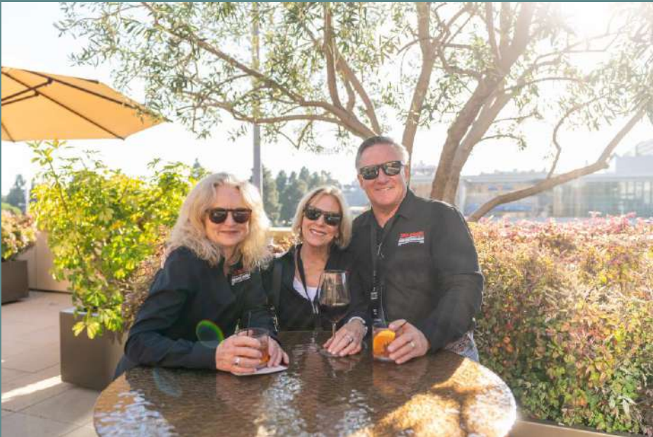
May 9th, 2025. Luskin Conference Center & Hotel @ UCLA